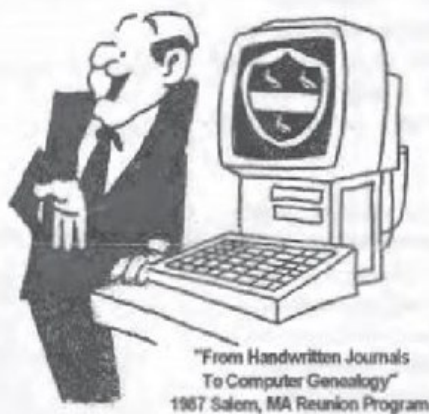
“From Handwritten Journals To Computer Genealogy” 1987 Salem, MA Reunion Program